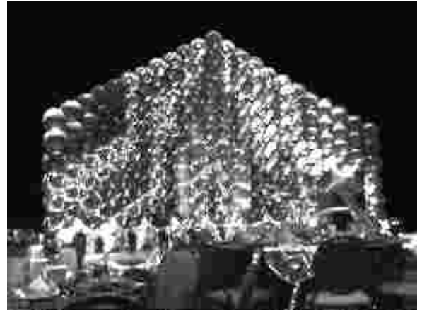
This backdrop was first used at the 1998 All Star Revue balloon convention in New Jersey, USA. (shown above)

Fill the openings with 18" round foil balloons or with latex balloons inflated 13.5" in diameter. You may use standard round balloons or Geo balloons.